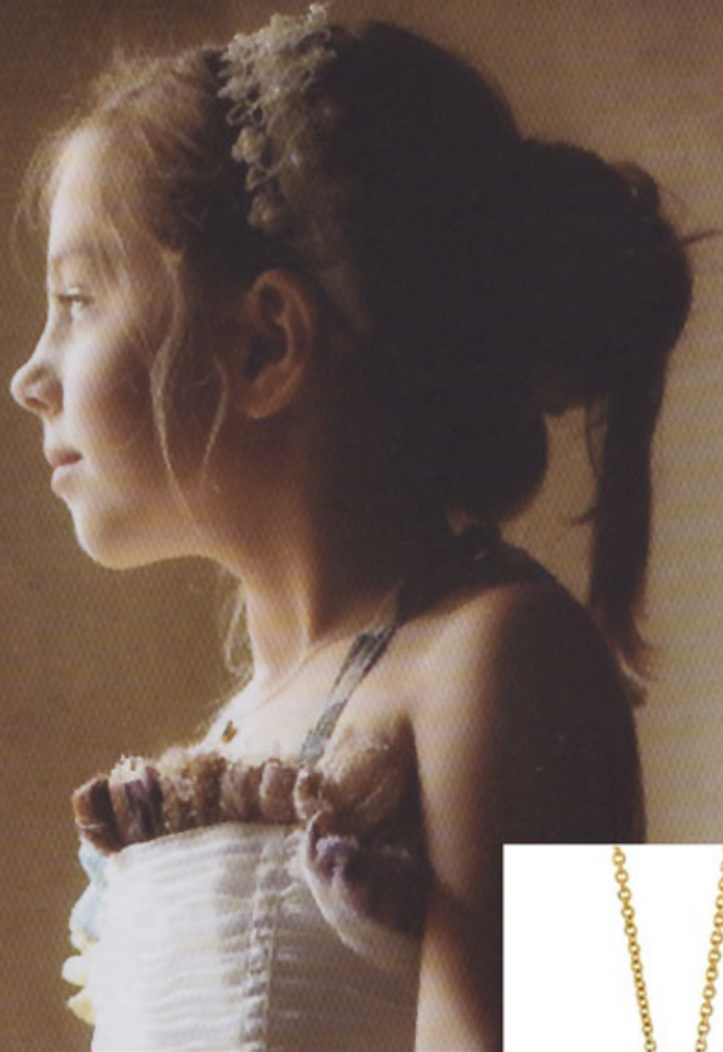
Quilted halter gown from Fancy Kids Collection , Andrea's Beau crème beaded headband, and pear iceing pendant necklace from Iceing on Top